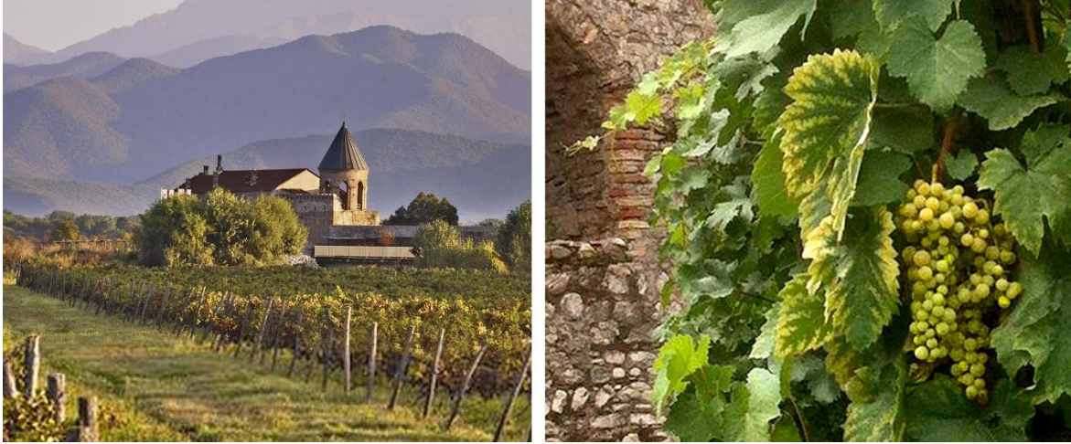
Vineyard in Kakheti.

Continued discoveries of grape seeds and vine remnants thousands of years old, sealed within ancient clay vessels, have reinforced the notion that Georgia played a high position in the origins of viticulture. Georgians have taken pride in their winemaking for many generations. Mention of sophisticated winemaking practices in Ancient Georgia can be found in the writings of Homer and Apollonius of Rhodes. It is even said that the unique Georgian alphabet is modeled after the shape of the vine's curled offshoots.