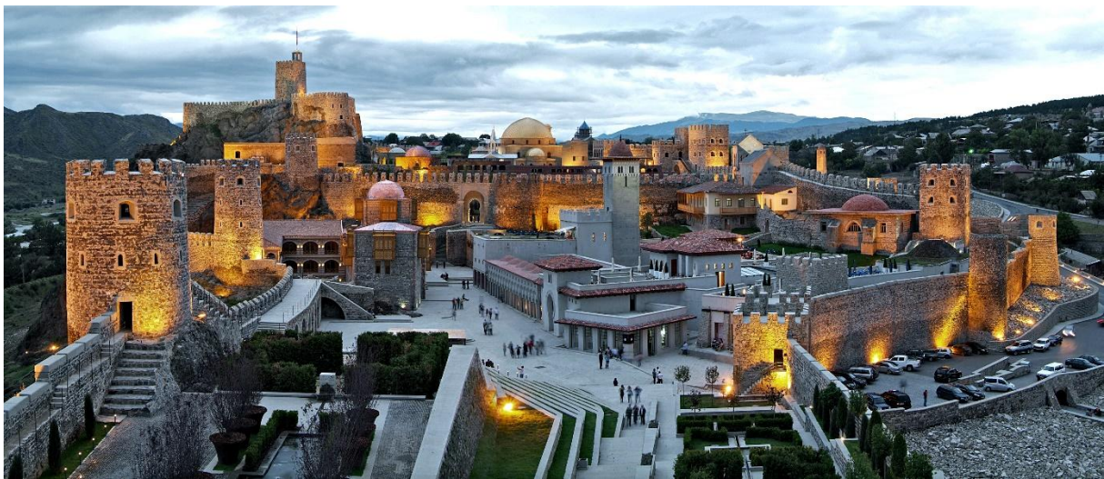
Akhaltsikhe

October 6, Day 14: Akhaltsikhe to Kazbegi. During this travel day, we will head once more towards the Greater Caucasus range, making brief birding stops along the way as we drive up the renowned Georgian Military Highway, a traditional route used since time immemorial, which now connects Tbilisi to North Ossetia in the Russian Federation. On the way, we may look around the impressive 17 th century Ananuri Fortress complex and the adjacent Zhinvali Dam. The adjacent forests can turn up a variety of seasonal and altitudinal migrants including Fire-fronted Serin, warblers and residents including Long-tailed Tit, Black Woodpecker and others. At roughly 7,200 ft. (2,200 m) and above the tree line, we will reach Gudauri, where a brief stop may render both Red-billed and Yellow-billed choughs, and with luck a Lammergeier (Bearded Vulture.) We will also make another stop at the Jvari Pass, where the highway reaches its highest elevation at 7,815 feet (2,379 m) in search of species such as Water Pipit, Ring Ouzel, Alpine Accentor and White-winged Snowfinch.