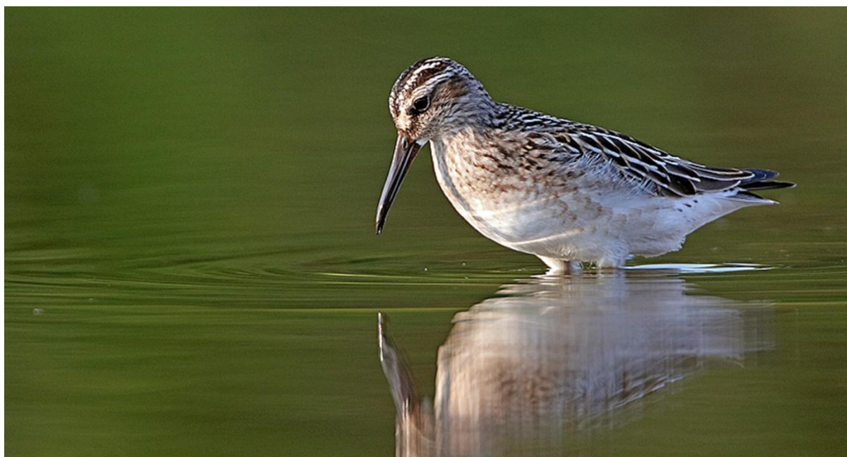
Broad-billed Sandpiper