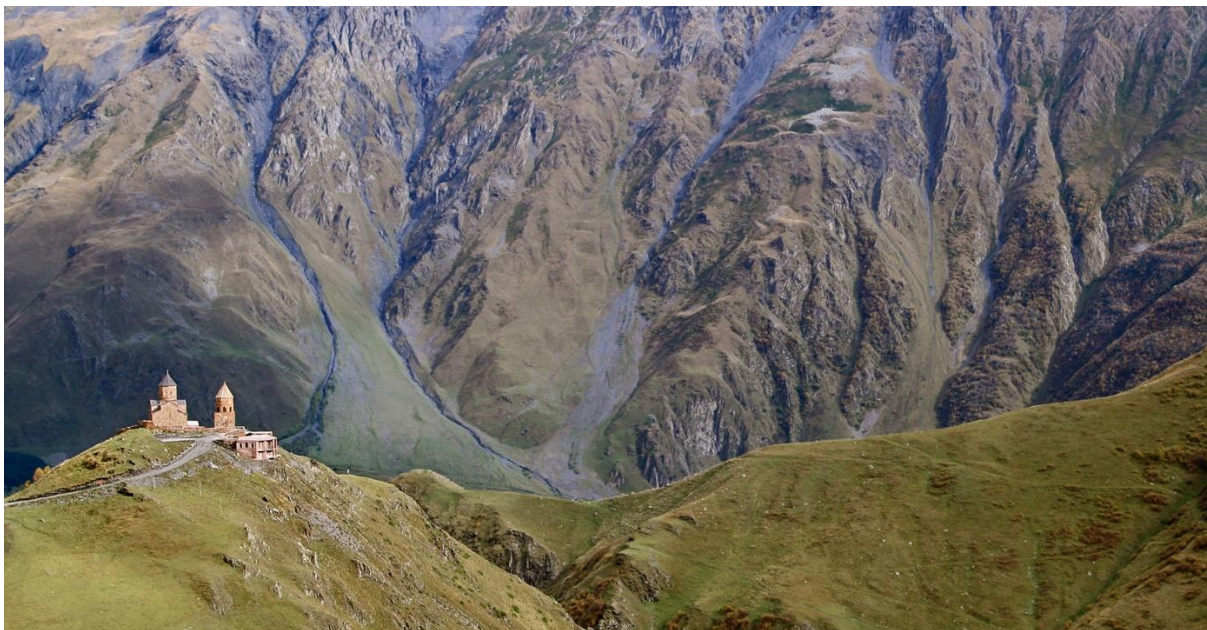
Gergeti Trinity Church, Kazbegi

We will spend time in the Greater and Lesser Caucasus ranges, surrounded by stunning snow-covered peaks and dramatic vistas in search of both Caucasian and Caspian snowcocks, the endemic Caucasian Grouse, Güldenstadt’s Redstart, Alpine Accentor and Lammergeier. Mountain passes may grant us Mountain Chiffchaff, Krüper’s Nuthatch and Fire-fronted Serin. Lakes and wetlands may host Great White and Dalmatian pelicans and large numbers of waterfowl including Velvet Scoter. To the south and east, landscapes will grow increasingly drier. Carved out of the cliffs, the medieval cave settlements of Vardzia and Gareji will blend into the semi-desert as we look for Western Rock Nuthatches, Calandra Lark, Tawny Pipit, Pied Wheatear, Egyptian Vulture and Imperial Eagle.