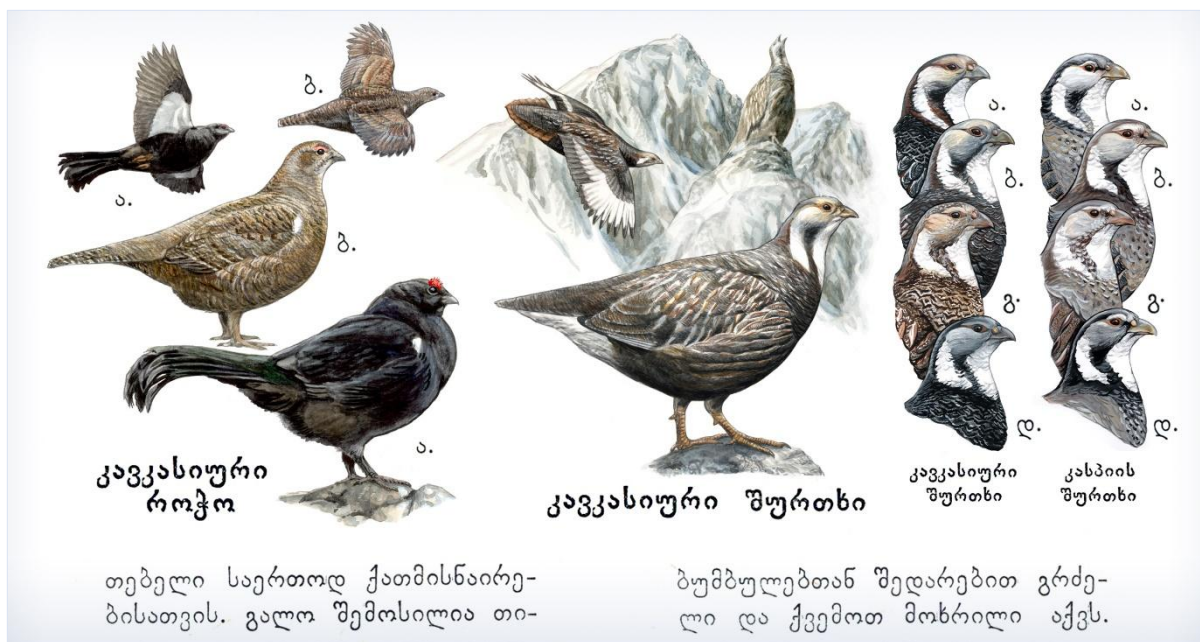
Illustrations by Rafael Gálvez. Caucasian Grouse, Caucasian and Caspian snowcocks, featured in "Birds of Kolkheti" (Buneba 2005) – showcasing Georgian script.

October 7, Day 15: Kazbegi. This morning, we will drive from our base at Stepandsminda to mountain slopes at an altitude of 7,120 ft. (2,200m) overlooking the valley below and the peak of Mount Mqinvarsveri – or Kazbegi. From here we will scan the slopes for the endemic Caucasian Grouse and listen for the haunting calls of Caucasian Snowcocks from the surrounding hillsides, searching for birds perched upon clifftops or flying along the slopes. If we are very fortunate, inclement weather may push Gldenstadt's Redstarts and Great Rosefinches from the higher regions and we will be vigilantly in search of these two beautiful and sough-after species. Here we are also likely to see Lammergeier (Bearded Vulture), Griffon Vulture, the pale "Caucasian" Twite, Fire-fronted Serin, Alpine Accentor, Rufous-tailed Rock-Thrush and Black Redstart. With persistence, we may even catch glimpses of an interesting goat-antelope – the endemic East Caucasian Tur – which can sometimes be seen on rocky outcrops. As we search, a brief splash of crimson may reveal the butterfly-like movements of a Wallcreeper against the mountain. The forests below the church may hold Mountain Chiffchaff and other woodland species – with luck maybe even a late Green Warbler. Bushes down in the valley are often teeming with migrants, while migration of Black Kites, Steppe Buzzards and harriers may be continuing strong above us.