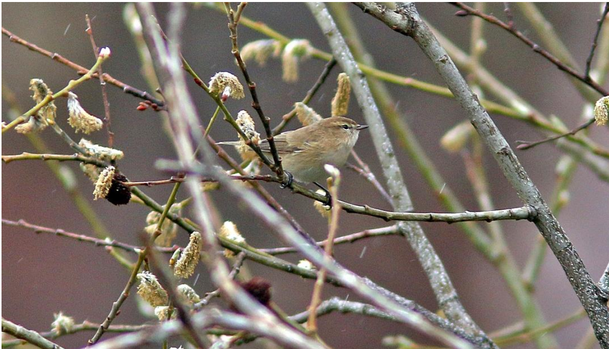
The "Caucasian" Mountain Chiffchaff is a specialty of the region

October 4-5, Days 12-13: Zekari Pass and Javakheti. After leaving Kutaisi, we will explore the southern mountain passes in the Borjomi-Kharagauli National Park, one of the oldest and largest conservation areas in Georgia, occupying more than 1% of the nation's territory. Although the park received its current status 20 years ago, it was already a renowned nature preserve for members of the Romanov family during the 1860's under the Russian Empire, following a long tradition as a hunting territory for Georgian nobles dating back to Georgia's Golden Age under Queen Tamar's rule in the 1200's. This morning we will cross a sliver of the park along its western edge, into the Lesser Caucasus Range by driving up the Zekari Pass on the slopes of the Meskheti Mountains.