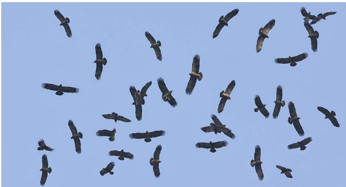
Lesser Spotted Eagles migrating

The tour starts in the country's prime wine region, east of the capital where we will enjoy a traditional Georgian feast and wine, and some leisurely birding in order to acclimate. After we have explored the arid and vast habitats east and south of Tbilisi for a couple of days, we will head west towards the slopes of Adjara, along the Black Sea. We will visit sites near Batumi where numerous Short-toed, Booted, Steppe, and both spotted eagles are tallied. These are fantastic sites for birds of prey in general, including kites and harriers, while the surrounding region turns up a diversity of shorebirds, terns and gulls, such as Armenian, Slender-billed and Pallas's. Yelkouan Shearwaters may be visible offshore, while the possibilities for songbirds on the coast include Thrush Nightingale and Siberian Stonechat.