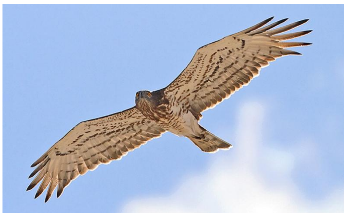
Short-toed Snake-Eagle

thickets are a magnet for migrants, and the delta has been designated an Important Bird Area. We will start our day in search for waders, shorebirds, gulls and songbirds. Gull species at the site include Slender-billed, Black-headed, Yellow-legged, Little and Caspian, among others. At this time of year, Parasitic Jaegers, Yelkouan Shearwaters and several tern species may be present, while Black-winged Pratincole, Red-necked Phalarope and Gray-headed Swamphen are all possible. This site has also turned