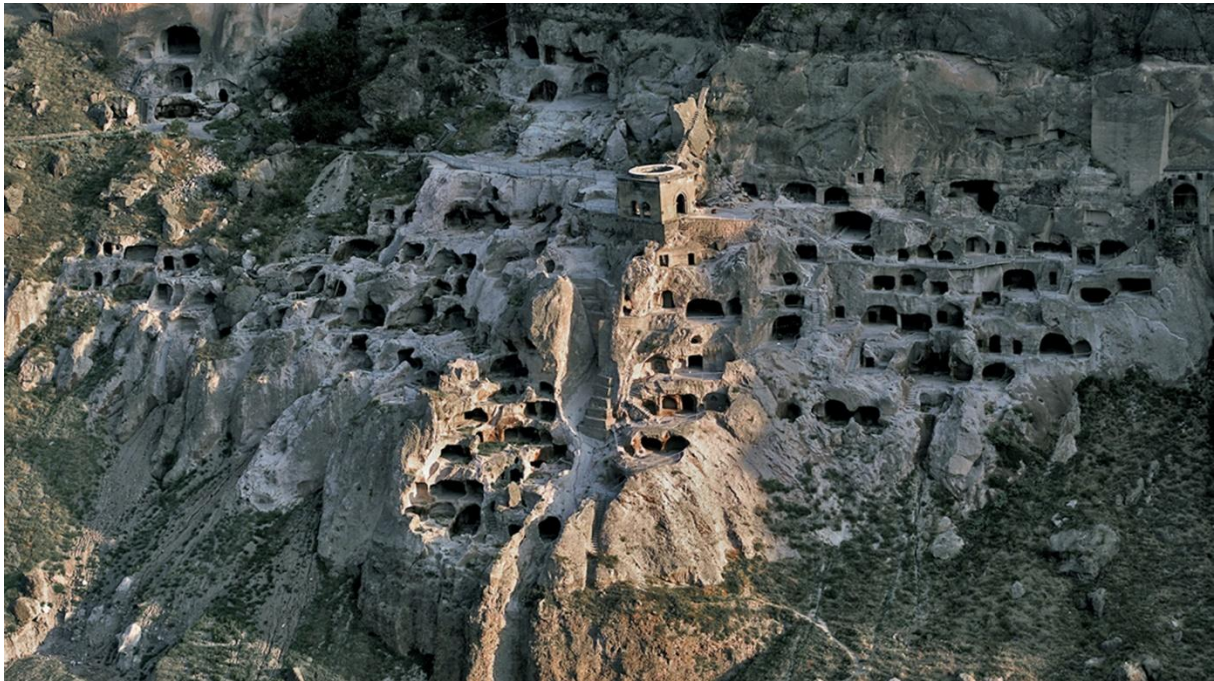
The cave complex of Vardzia

During this and the following day, we will explore a number of sites near our base of Akhaltsikhe, including Javakheti. The vast open landscape of the Javakheti Plateau has been a traditional summer destination for semi-nomadic pastoral communities stretching to Anatolia for ages. In this manner, it is thought that the Cappadocian missionary St. Nino first brought Christianity to Georgia during the 4 th century, carrying her grapevine cross through Javakheti, eventually reaching the ancient Kingdom of Iberia in eastern Georgia and converting Queen Nana and King Mirian III.