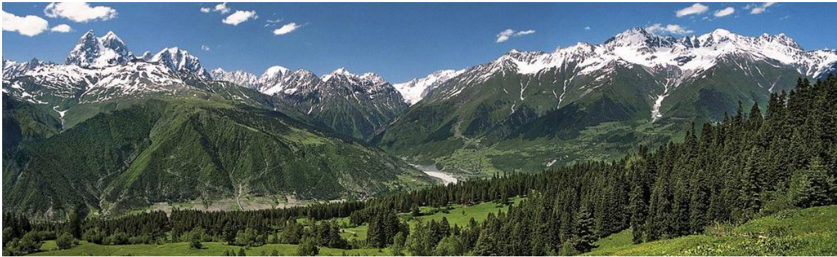
The Greater Caucasus as seen from Svaneti

September 30, Day 8: Through Colchis, towards the Greater Caucasus. Today we will drive north along the Black Sea coast towards Svaneti, the ancient land of the Svans, a region within Georgia with distinct cultural and linguistic characteristics. Before beginning our ascent to the Greater Caucasus range, we will visit Kolkheti National Park, near the port city of Poti. As the name of the national park implies, this region is considered the gateway to the ancient kingdom of Colchis , the destination of the mythical journey by Jason and the Argonauts as they searched for the Golden Fleece. It is an area of wetland forests and lakes at the mouth of the Rioni River, which was called Phasis in antiquity. It is worth noting that the word “pheasant” derives from the name of this river, and that the Ring-necked Pheasant – Phasianus colchicus – was first described from this region.