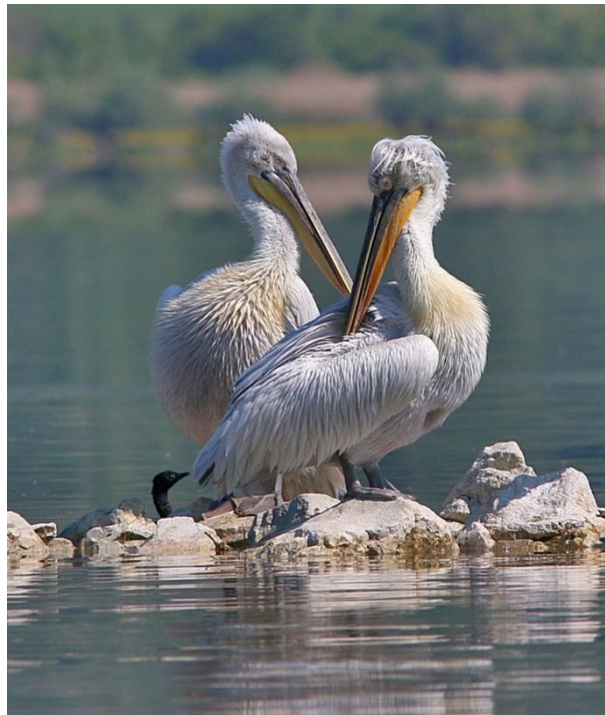
Dalmatian Pelicans

Our attention will turn to the arid plains and lakes of this distinct region. We will search the brush and surrounding thickets for migratory passerines, with a broad array of possibilities that could include short-toed larks, warblers, buntings, pipits and wagtails. The plains may hold resting Long-legged Buzzards and several other raptor species could be foraging overhead, including three species of harriers. The large lakes may hold many dabbling ducks of several species, as well as Red-crested Pochard, Tufted Duck, Ruddy Shelduck and with some persistence even the uncommon Velvet Scoter (now strictly Melanitta fusca ) – a well-deserved recent split from the North American White-winged Scoter (now Melanitta deglandi ). Dalmatian and Great White pelican are to be looked for in these lakes, as well as a wide possibility of shorebirds and waders. The “eastern” form of the Common Crane ( G. g. lilfordi ) is to be looked for here, with a breeding range contained through Transcaucasia. It is a near-endemic, distinctive by having a reduced red patch on the crown and being paler above.