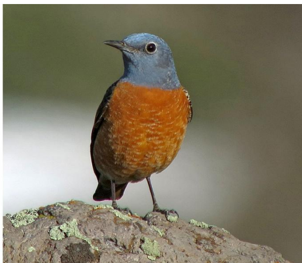
Güldenstadt's Redstart and Rufous-tailed Rock-Thrush

October 1, Day 9: Svaneti. The Greater Caucasus is a daunting mountain barrier that separates the North Caucasian republics and ethnic groups – within the borders of the Russian Federation – from the South Caucasian peoples, most of which reside within the borders of Georgia. Several peaks in this mountain range surpass 15,000 ft. (4,570 m) in elevation, making this a region where native endemic peoples have found refuge through the ages from waves of invaders and geopolitical structures. More than 30 languages are spoken in the Caucasus, many of which are non-Indo-European and spoken nowhere else on the planet! In this manner, the Svanetian people have preserved an ancient form of South Caucasian language and traditions that are different from that of the other South Caucasian groups. Likewise, the mountains preserve an unspoiled wilderness, with dozens of the largest glaciers in the region dotting the mountains of Svaneti.