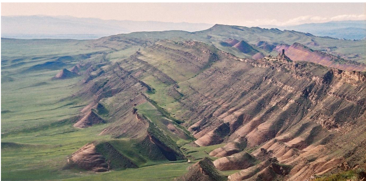
The ridge above David Gareji, at the border between Georgia and Azerbaijan