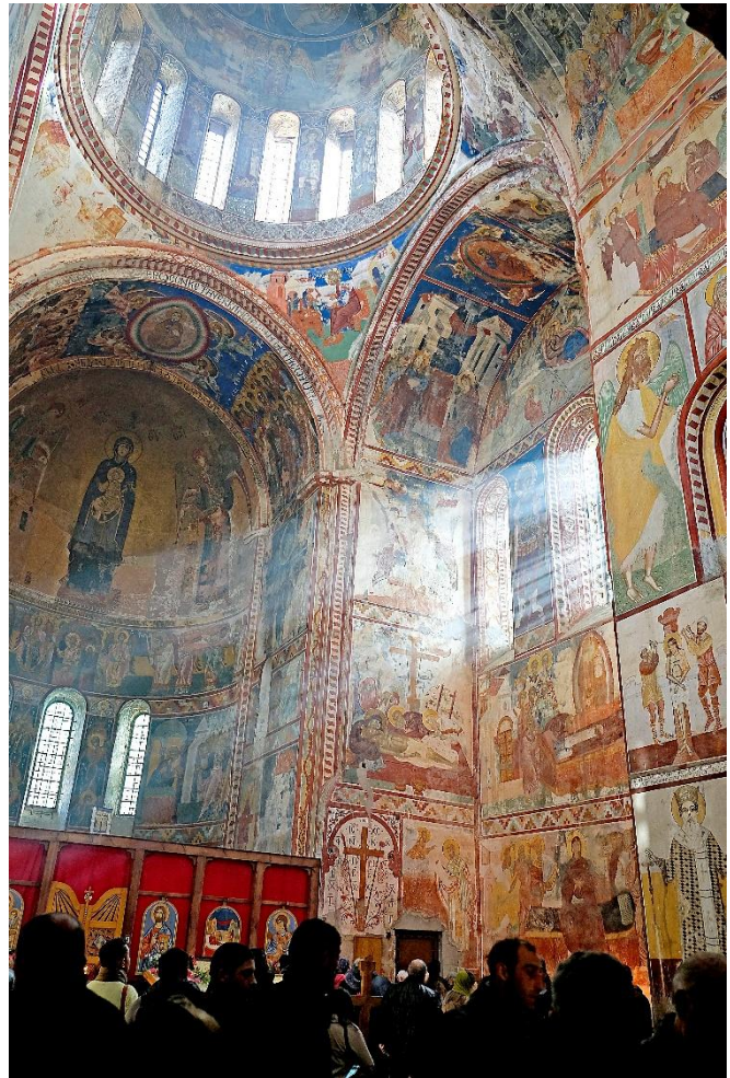
12 th - 17 th century frescos, Kutaisi

Dominated by the 11 th century Cathedral of the "Living Cross," Mtskheta was once the thriving trade center of ancient "Iberia" – the East Georgian kingdom – but is now a quaint hamlet at the confluence of the Mtkvari and Aragvi rivers. The Romans reached Mtskheta in 65 AD and maintained intermittent control of the region until the 7 th century. Contemporaries of Roman emperor Constantine the Great, Georgian King Mirian III and Queen Nana converted to Christianity in 337 AD. Mtskheta has a bounty of UNESCO sites, showcasing the high artistic and cultural level attained in medieval architecture by this ancient kingdom. We hope to visit a number of such historical landmarks. We will then continue westward towards Adjara, in western Georgia, arriving at the coastal city of Batumi in the afternoon.