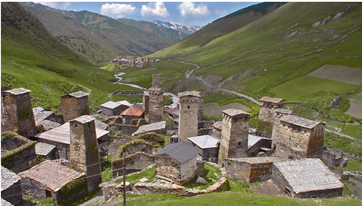
Medieval hamlets in Svaneti © Rafael Gálvez