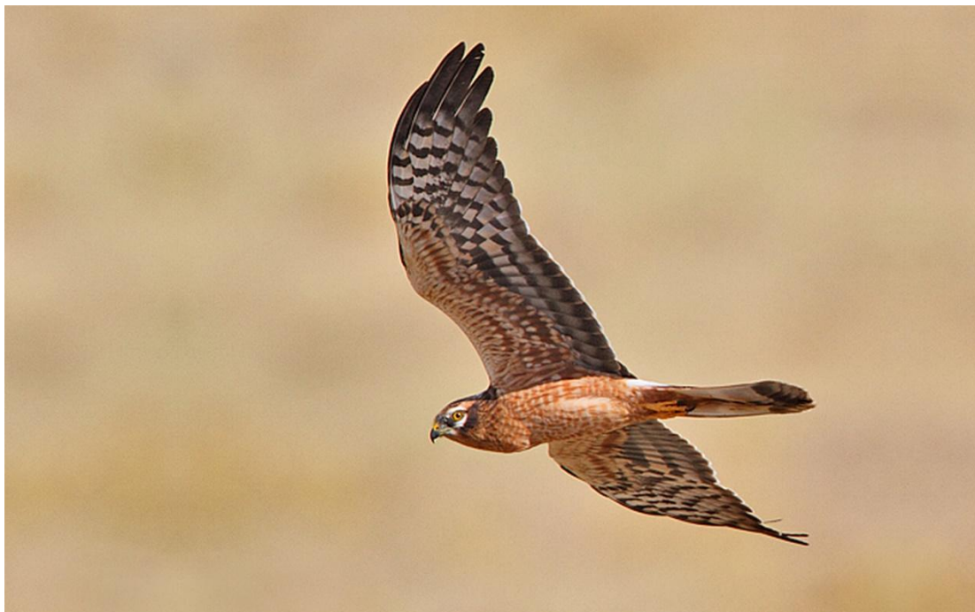
Montagu's Harrier

September 25, Day 3: Grape Harvest, Winery and Supra. This morning, we will do some birding as we head eastward towards Georgia's prime wine region. We may choose to stop for migrants at any of the preserves outside of the capital or along the Gombori Pass. We will also stop at historical sites, including ancient monuments and churches, to learn more about Georgian history before reaching the family-owned winery where we will have our first supra – or traditional Georgian feast.