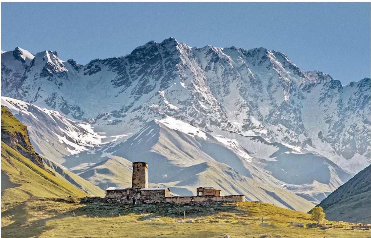
A medieval tower in Svaneti, Greater Caucasus Range

The ancient nation of Georgia in the South Caucasus is legendary for its copious “feast and wine” hospitality, its otherworldly chanting traditions, and for one of the most prominent bottlenecks for migratory birds. The Republic of Georgia lies in a region with a diversity of habitats ranging from semi-deserts to subtropical forests, bisected by rugged mountain ranges between the Black and Caspian Seas, and offering rich natural history and cultural experiences.