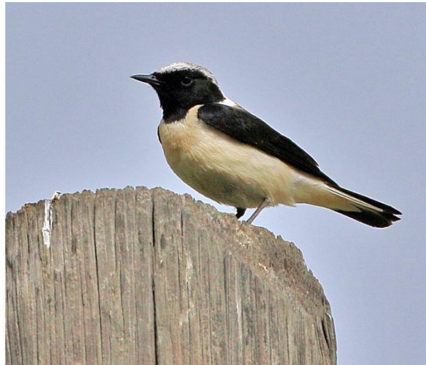
Pied Wheatear (left) and Eastern Black-eared Wheatear (right)

September 26, Day 4: Jandari Lake, David Gareji. From Tbilisi we will head east towards a vast semi-arid steppe region with rocky outcrops, shallow lakes and riverine forests. First, we will visit Jandari Lake at 950 ft. (291 m) in elevation, with a good breeding population of Pygmy Cormorants and a great stopover site for waterbirds. Here we are likely to find ducks, grebes, herons, shorebirds, terns and gulls including Armenian Gull. Several pairs of Imperial Eagle breed near the lake and we will look for these magnificent raptors as they forage over the adjacent grassy plains.